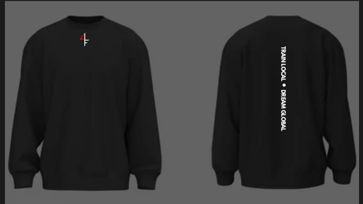
4Life Crewneck ($40 + tax)