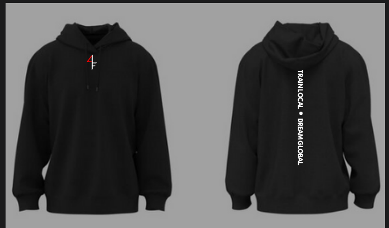
4Life Sweatshirt - Black ($40 + tax)