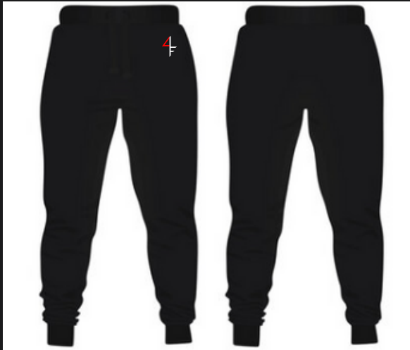
4Life Sweats ($45 + tax)