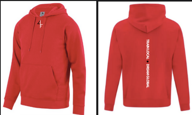
4Life Sweatshirt - Red ($40 + tax)